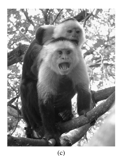
Figure 1. (Continued.)

closest relatives, including for example the chimpanzee ( Pan troglodytes , review in Muller & Mitani, 2005), as well as a number of non-primate species (reviewed by Harcourt & de Waal, 1992; Smith et al., 2010).